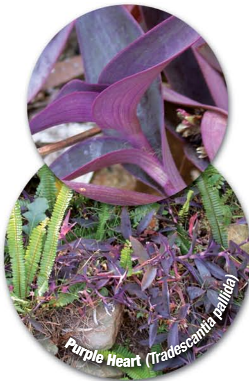
Purple Heart (Tradescantia pallida)