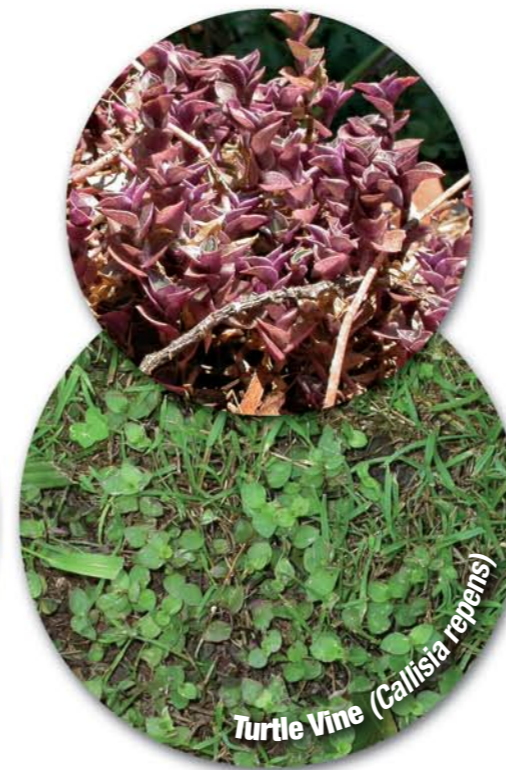
Turtle Vine (Callisia repens)