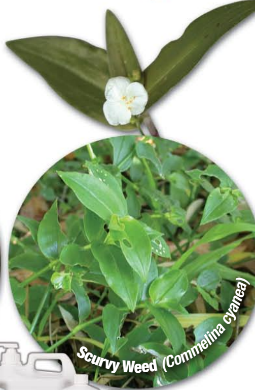
Scurvy Weed (Commelina cyanea)