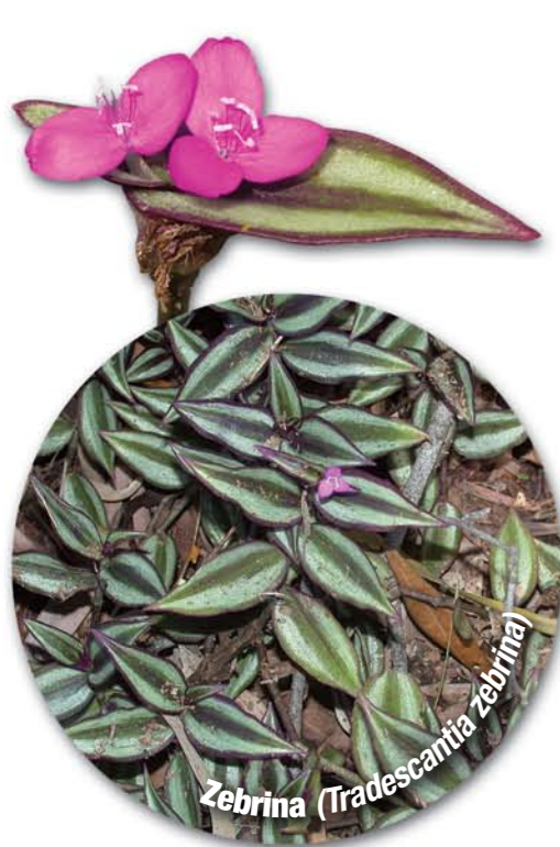
Zebrina (Tradescantia zebrina)

Does your pet have red, itchy skin on its stomach, chest, muzzle or between the toes? If so it could be a contact allergy to one of these plants. Ask your vet for more information.