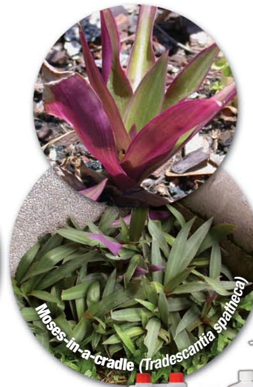
Moses-in-a-cradle (Tradescantia spathacea)