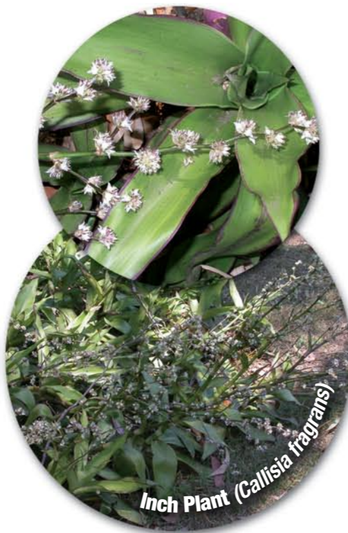
Inch Plant (Callisia fragrans)